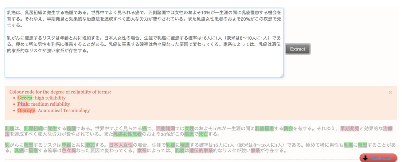
Figure 11. A screenshot of the Japanese term extractor