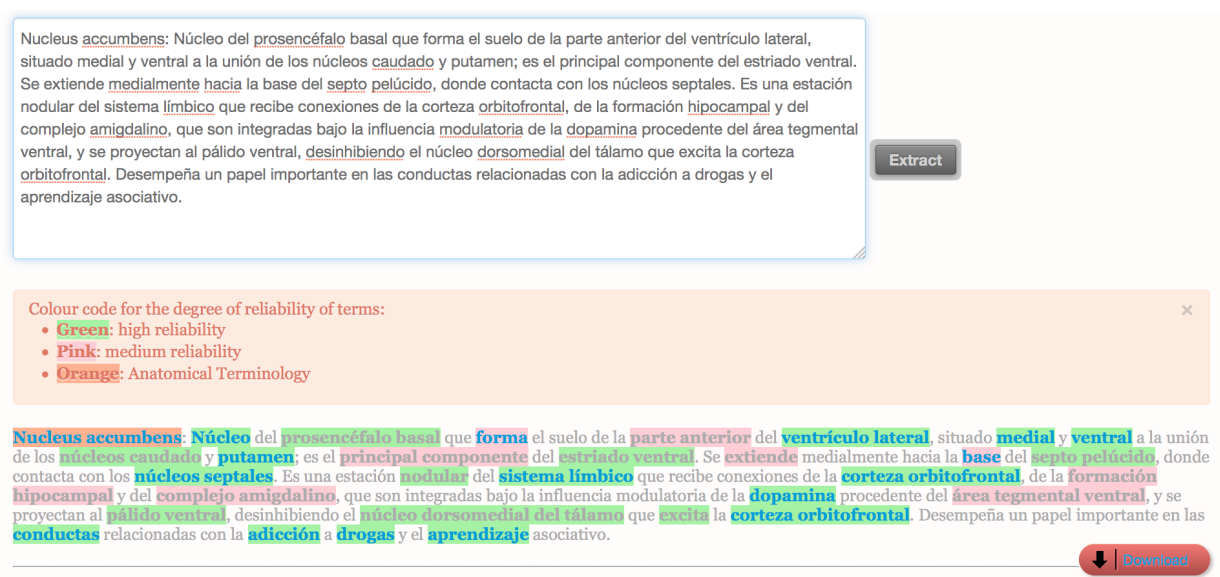
Figure 10. The medical term extractor for Spanish texts

The medical term extractor detects candidate terms from an input text (Figure 10). The tool highlights medical terms according to their level of reliability (medium and high, Figure 11). The user may also download the term list in text format for further use (see the red button in Figure 12). In addition, terms that are found in the BabelNet dictionary (Navigli and Ponzetto, 2012) contain a hyperlink to this resource, which provides their translation in many languages.